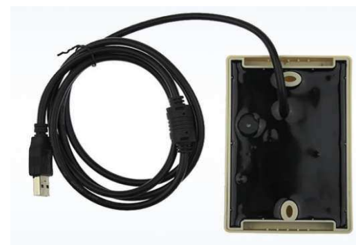
Back Side View